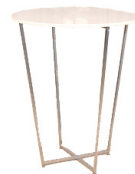
Gloss Display Table